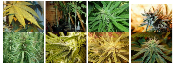
Figure 1. Images of cannabis plants collected from illicit drug websites.

According to the Wikipedia, the cannabis leaves are “palmately compound, with serrate leaflets” 1 . Specifically, the cannabis images on the Web has the following properties, which make the task of cannabis image recognition difficult: (1) non-uniform background; (2) different illuminations and occlusions; (3) visual similarity with some other plants in the leaf shape; and (4) the shape deformation of the leaves. Examples are in Fig.1.